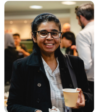
EdCAT 2024 Highlights